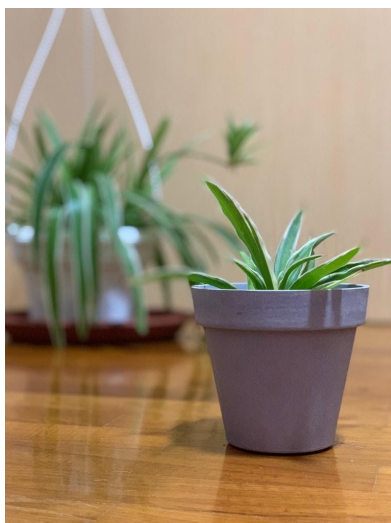
Figure 3: An offspring of the spider plant in the background, which concurrently holds a few other stolons

While it might not be an easy feat, pilot programmes, where the government gives out a free spider plant per household, can be held in some neighbourhoods. These houseplants can be first grown in the Singapore Botanic Gardens, where tourists and locals alike can observe them.